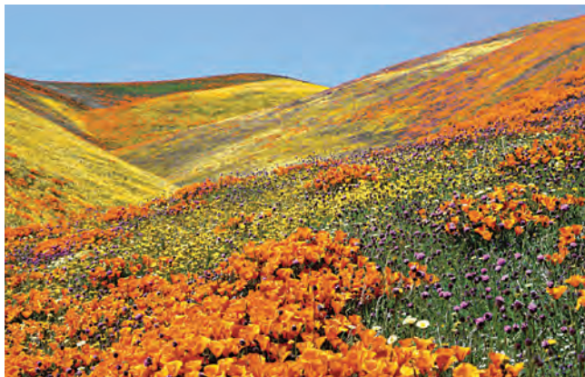
Valley of Flowers

important places related to the Indian war of independence in 1857, etc.